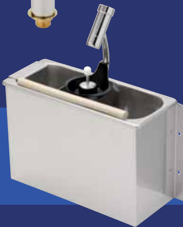
926 004 Unlimited Silver WATERSTOP Exclusive