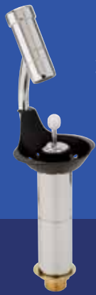
926 001 Advantage Silver WATERSTOP