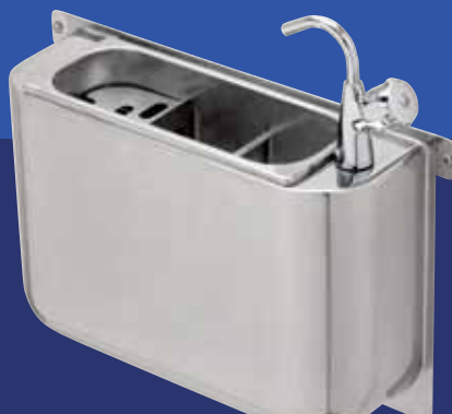
910 200 Permanent Exclusive Plus