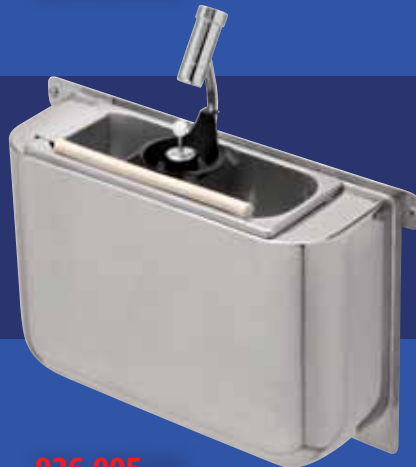
926 005 Unlimited Silver WATERSTOP Exclusive Plus