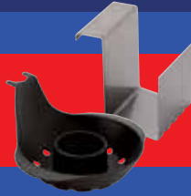
926 002 Comfort Silver WATERSTOP